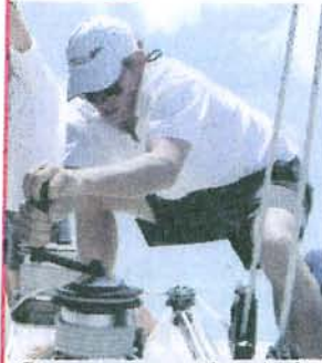
Crew member at the winch