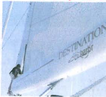
Destination, Fox Harbr!