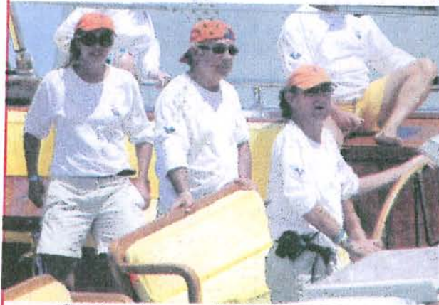
Captain and crew on ANDROMEDA LE DEA