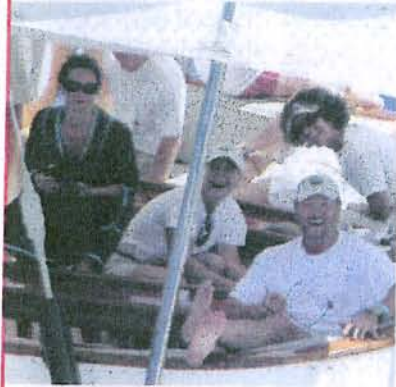
Smily Crew on AVALON