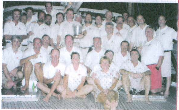
Ant the winners are: Crew on FREEDOM!